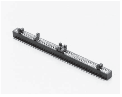
Combination of JX-01 and PCW-1-1