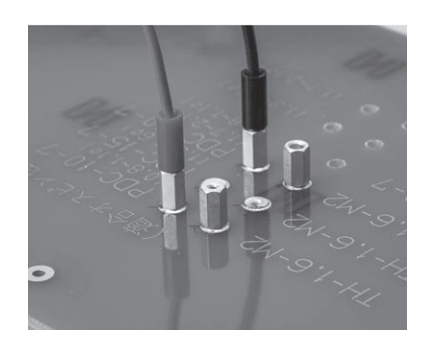
PDC series • TH-1.6-M2 is used on the PC board side.